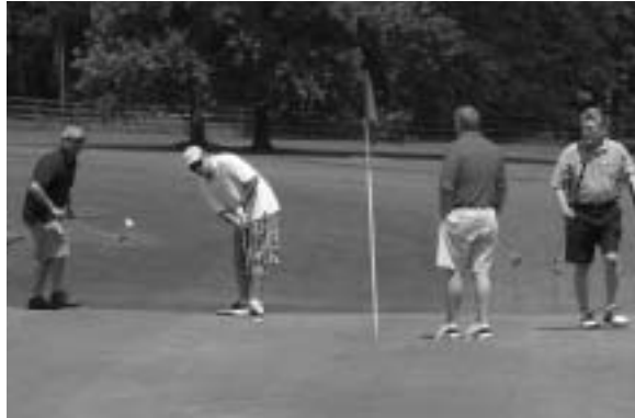
Foursome works to line up the perfect shot.

Bell Insurance, Inc. Rager, Lehman & Houck