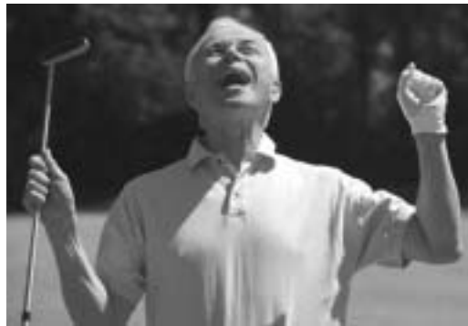
Photo of you kickin some major green on the golf course!

You can nurture existing business relationships, develop new contacts, and of course, have lots of fun at the Hanover Chamber's 41st Annual Golf Outing on Wednesday, June 24th at South Hills Golf Course in Hanover.